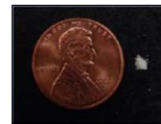
2 milligrams of powder next to a penny.

Carfentanil is a synthetic opioid approximately 10,000 times more potent than morphine and 100 times more potent than fentanyl. The presence of carfentanil in illicit U.S. drug markets is cause for concern, as the relative strength of this drug could lead to an increase in overdoses and overdose-related deaths, even among opioid-tolerant users.